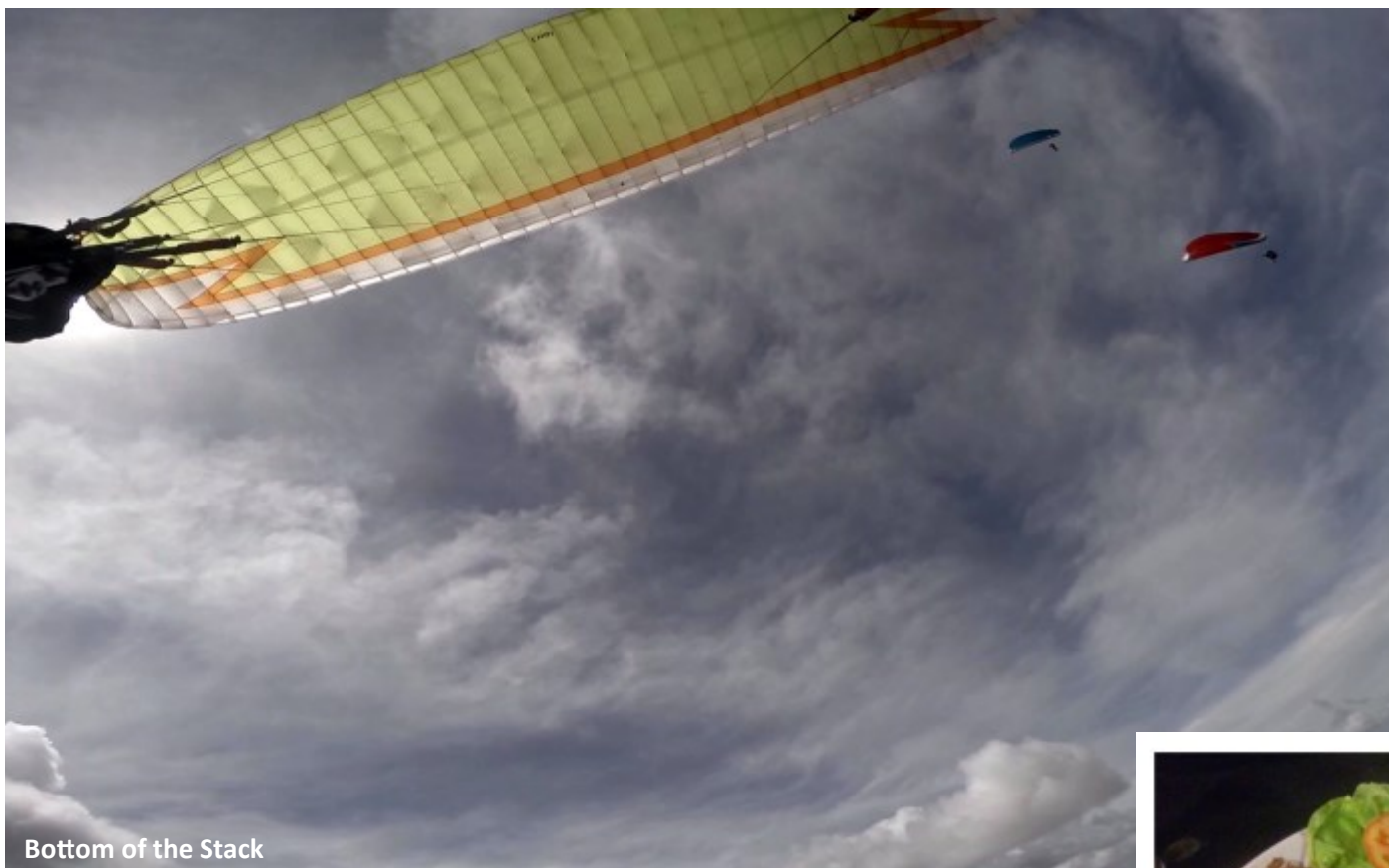
Bottom of the Stack

with excellent food and lots of Skol! Try the national drink of Caipirinha which is a potent cocktail made from Cachaca (sugar cane liquor) but not more than 2 in a session as it's rocket fuel! Other food and drink highlights included Swiss lemonade, Excecutivo (meat with chips, salad, rice and a beany accompaniment), cake for break-