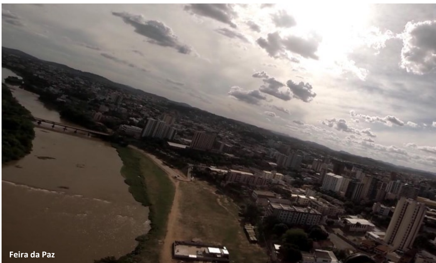
Feira da Paz

pee I calm down and am eager to get going. A good launch, but I struggle to get any decent climbs so head towards a possible thermal source and am rewarded with a nice climb. I lose it before I get to base but set off to try and catch the others anyway, after playing spiragraph in the sky for a while but getting away from GV I