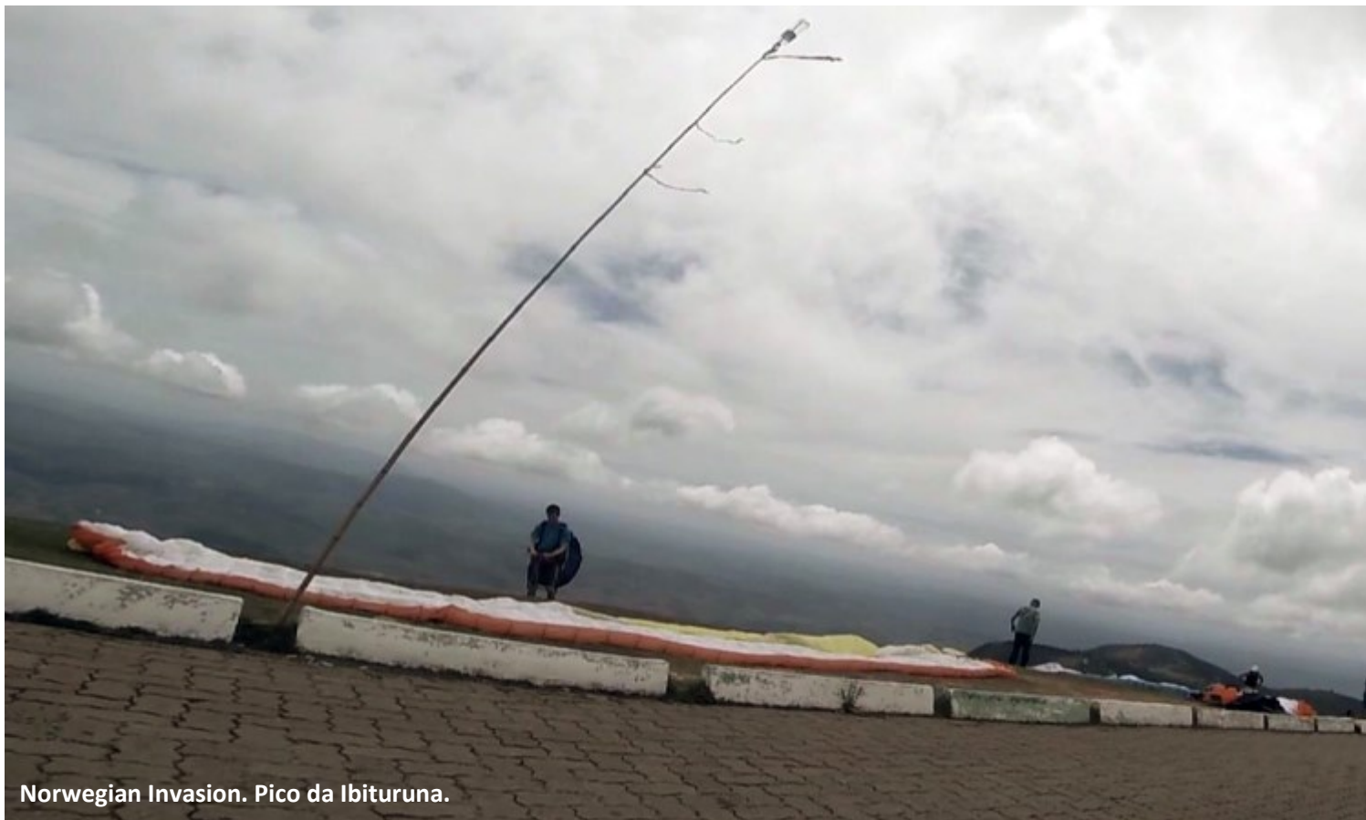
Norwegian Invasion. Pico da Ibituruna.